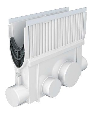
T1400-CB620-13 Galvanized Edge Rail

4" OUTLET CATCH BASIN (6" OUTLET ALSO AVAILABLE) Sediment bucket included