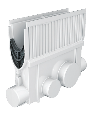
T1400-CB620 No Edge Rail

MIFAB®'s T1400-CB620 Catch Basin shall be 19.7"(500mm) long with a 4" (100mm) internal width. The catch basin 18.8" deep. It is available with a 4" or 6" outlet. A sediment bucket is included with every basin. The catch basin is made from High Strength Glass Reinforced Polyester (GRP). Each catch basin comes with either ne edge rail or galvanized edge rail. The catch basins achieve Load Class A-E depending on the grate utilized.